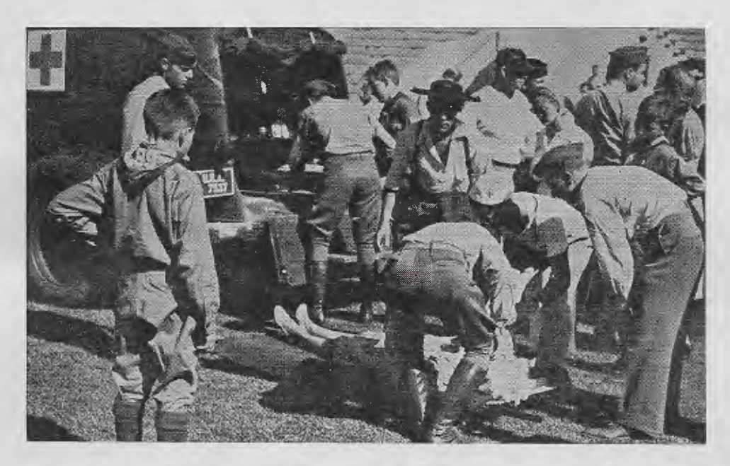
Typical of many such cases occurring September 20 in Los Angeles during the day-long parade of the American Legion under a blistering sun, men of Company D, 115th Med. Regt., Long Beach, are pictured in action as they came to the aid of a woman who fainted from the effects of heat and closely packed throngs of spectators.

Company D, 115th Med. Regt., Long Beach, assisted in first aid work during the American Legion's national convention parade in Los Angeles September 20.