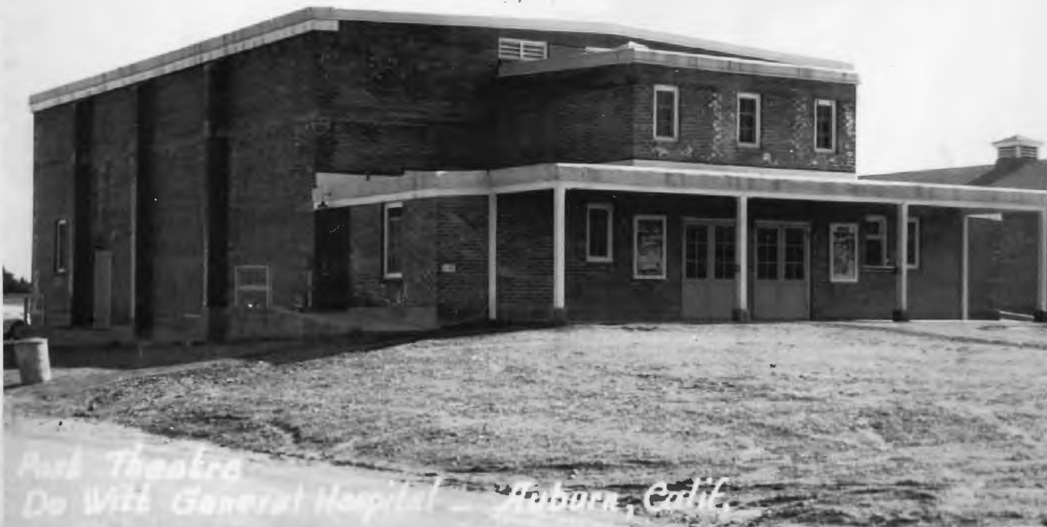
Post Theatre Do Witt General Hospital - Auburn, Calif.