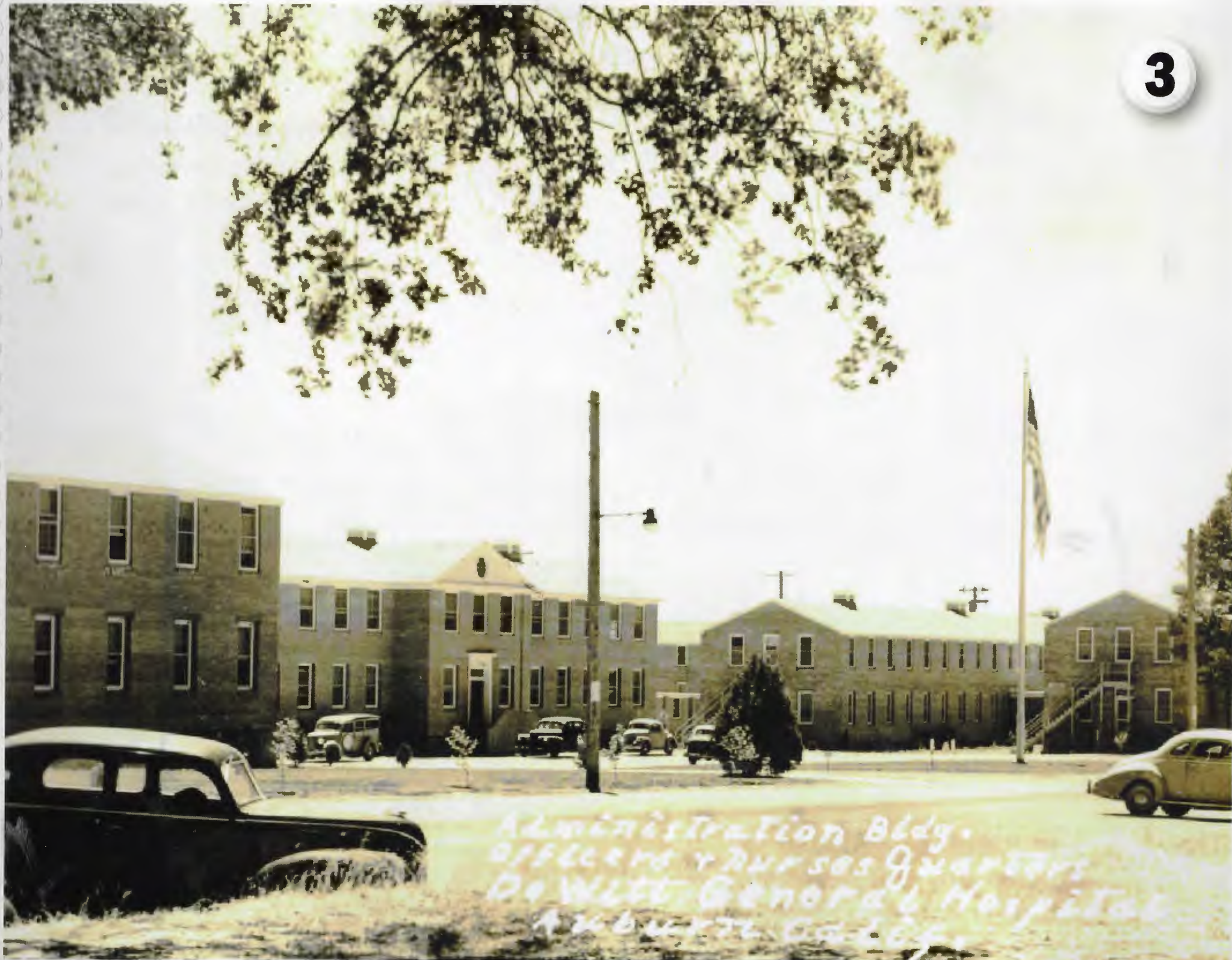
Administration Bldg. Officers & Nurses Quarters DeWitt General Hospital Akeley Calif.