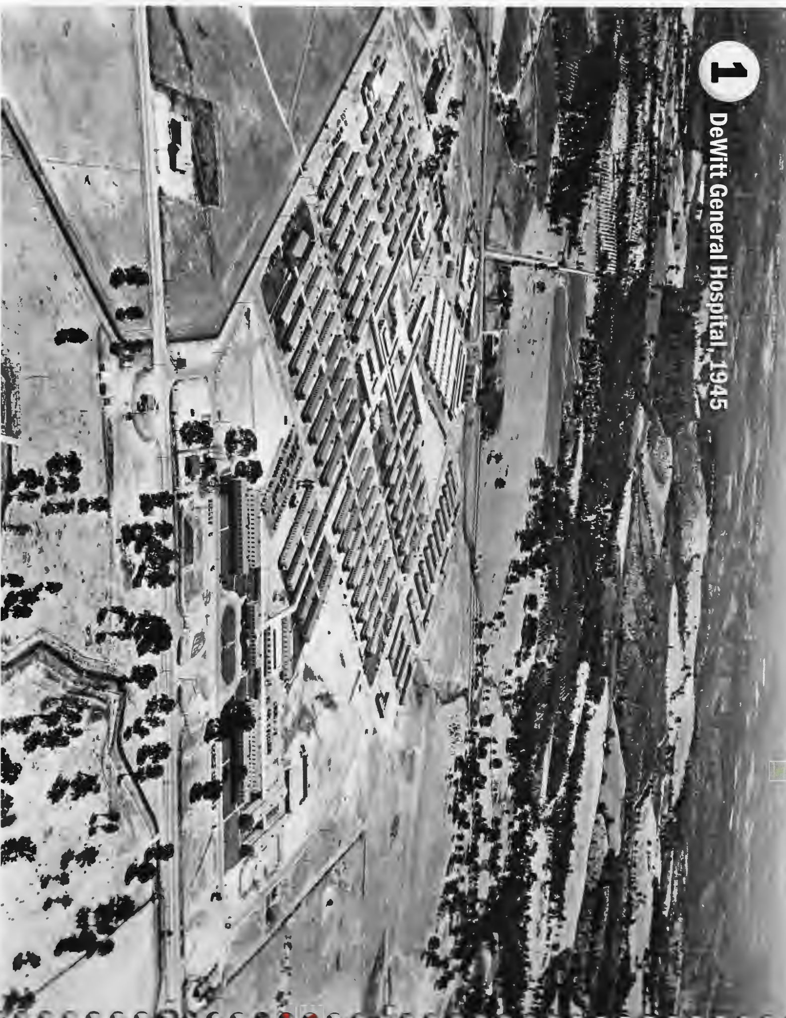
DeWitt General Hospital, 1945