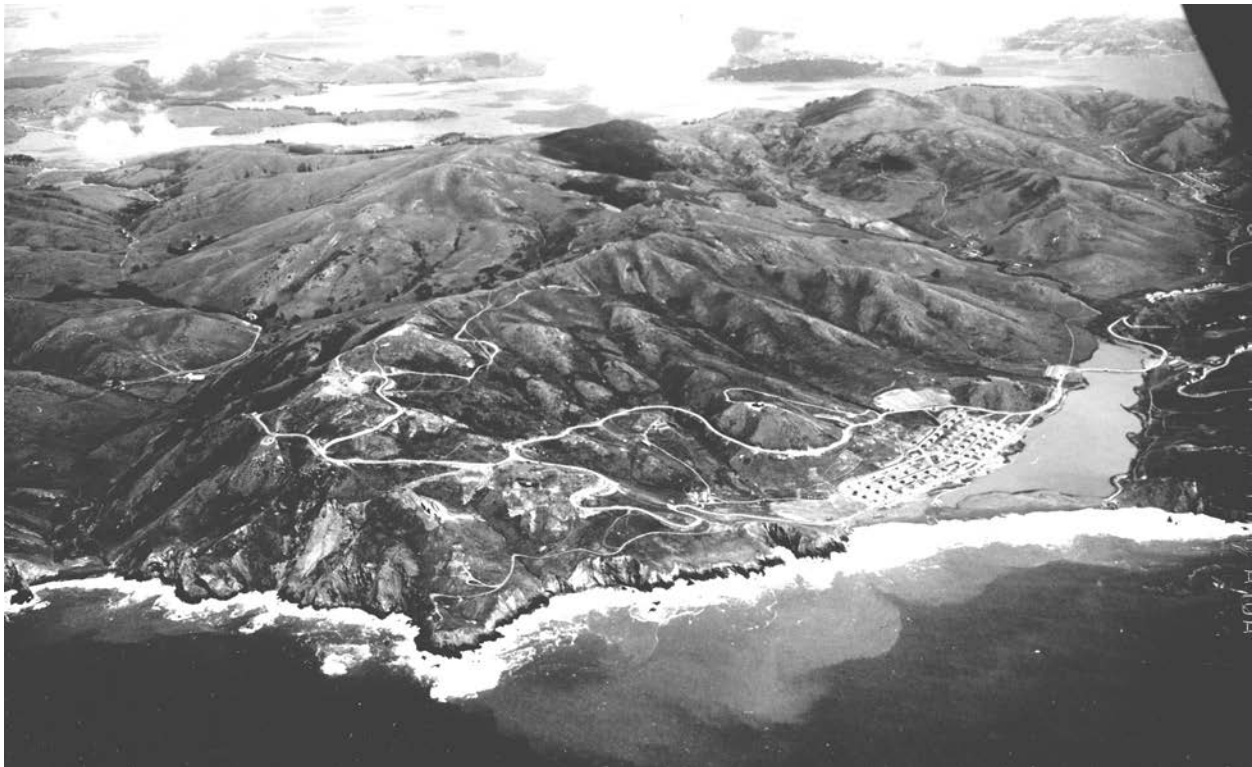
Fort Cronkhite April 26, 1944, before tone-down camouflage. NARA RG 77, Entry 1007, Box 136

Camouflage was already being planned before I took over command of the battery. They had strung out cables from the top of the parapet to anchor bolts in the ground and put a great net that we could collapse very quickly and tow these cables out of the way to get the gun in position to fire. Of course, they had something different for the three-inch guns. There were flat things with cables running out of them. I'm not too familiar with them.