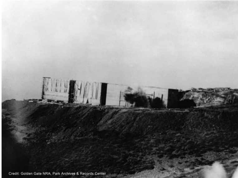
Battery Townsley test blocks.

Well, it was kind of a neat problem. They had to define the muzzle velocity of the shell to approximate the terminal velocity of a bomb. So they had to use different powder charges to get the results they wanted. So they brought out an ordnance powder man, a civilian from Salt Lake City, who happened to be in the corps area command structure. He made up the different sizes of powder charges. We were going to fire a live armor-piercing shell, but the ordnance man deactivated the base fuse, which sets it off. They wanted just to get the simple penetration.