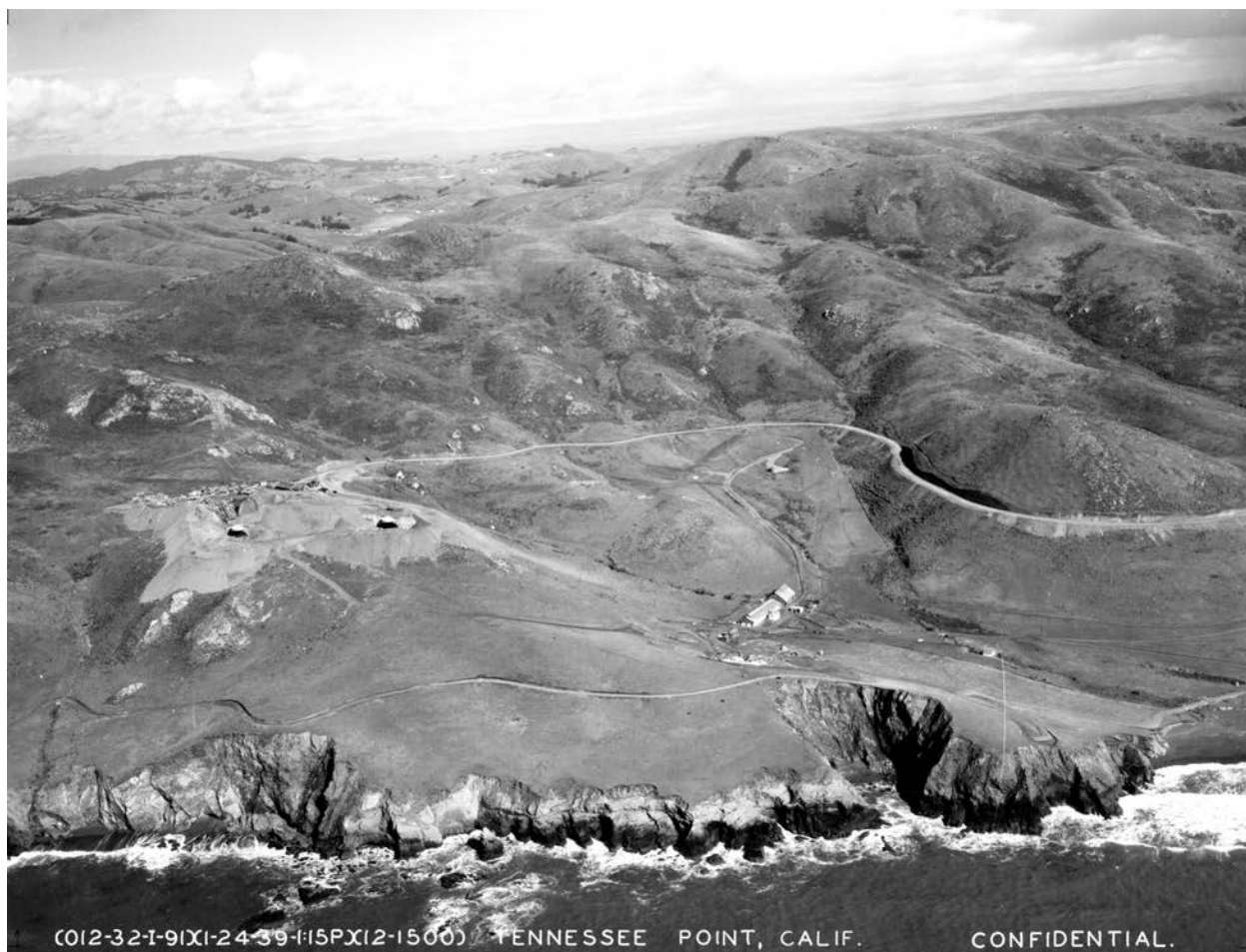
Fort Cronkhite, 1939. NARA Still Pictures, 342-FH, B17205

We found a lot of foggy weather there in summer, of course, so we finally ended up sending them over to Oakland every day. I guess the Army Air Corps provided a plane for us to track. That was another one of the facets of training that went on.