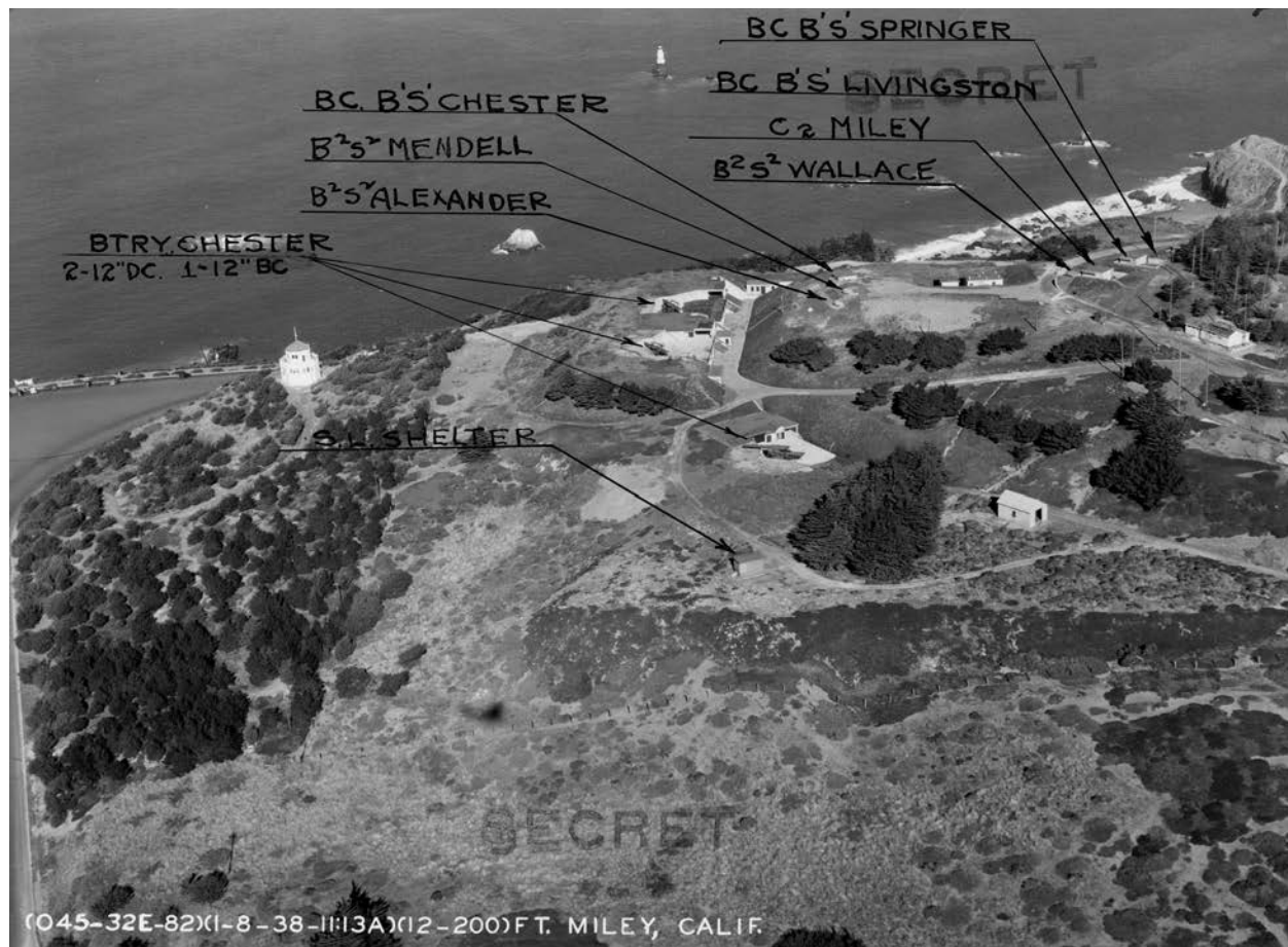
Fort Miley, 1938.

In May, we were moved to Battery Chester [two 12-inch DC, one 12-inch BC] at Fort Miley, a 12-inch disappearing battery with that one old 1892 barbette carriage, with the hoist to raise the shells up. It was sort of a museum piece, really obsolete. But they weren't going to give up on them because, I guess, the overall idea was use whatever you have. I commanded that battery, and there we started our continued training; not only artillery, but even mob control. This was just routine, but there are a lot of techniques that have to be learned so you don't fire at people indiscriminately. We trained in chemical warfare, infantry, use of the bayonet, and small arms target practice.