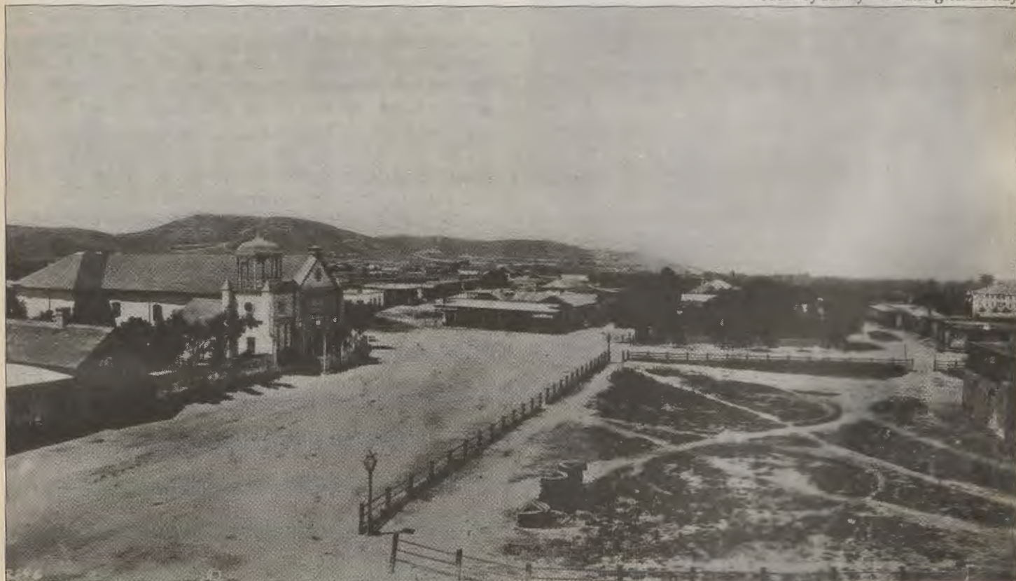
Old center of Los Angeles. La Plaza on right; Plaza Church to left. Brick structure in Plaza at far right was city water tank. Behind is Sonoratown, where most of the Californios lived.